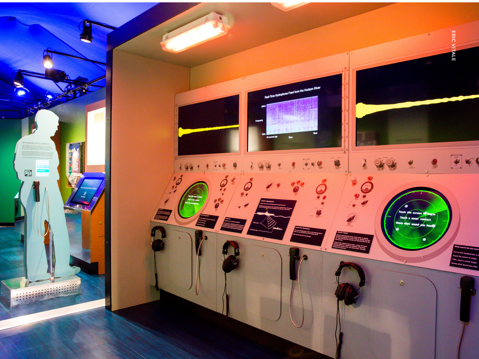
fig. 5. The final version of the sonar interactive has a touchscreen interface below (the green circle) and a waveform visualization of each sound on a monitor above.